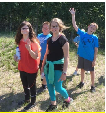
Norman County East Summer Recreation Field Trip to Fertile Sand Hills

With this in mind, an Endowment Fund was recently established and the Board is currently engaged in developing fundraising campaigns through partnerships with GiveMN and Giving Hearts Day. Success in these efforts will help provide assistance to schools to defray costs of bringing students to the rich outdoor learning environment of the Agassiz ELC and the Fertile Sand Hills where students will enjoy experiences that last a lifetime.