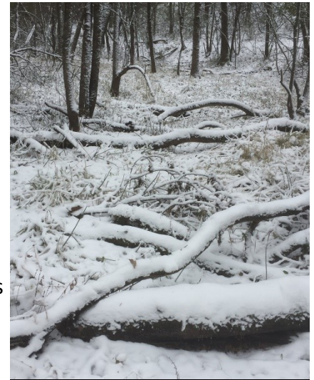
Scenic Sand Hill River oxbow