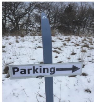
Old skis repurposed as signposts along Sand Hills trails

Several “Parking arrow” signs were installed to help guide people back to the trailhead and parking area.