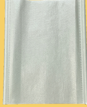
Cloth Panels - 6 qty