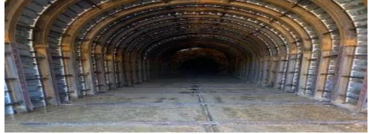
A snapshot of the new and improved Russell Portal

In addition, the Wardner operating yard was connected to the power grid, and procurement for new mining equipment was completed. The footprint for the Wardner yard has increased from the redistribution of waste from the Russell Portal enlargement, and two new office buildings as well as a shop have been assembled.