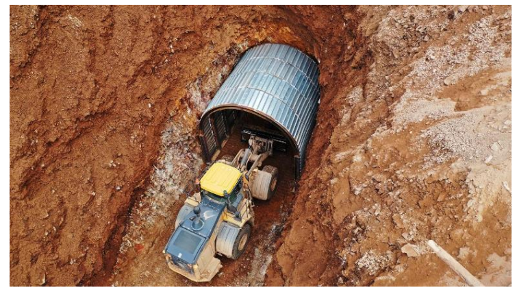
A view of the new steel sets for the Russell Portal before they were buried

In addition to these activities, a drilling contract with Dynamic Drilling, Inc. was recently executed in support of a drill program that commenced in May 2024, and will last for much of the year to facilitate both resource definition and resource expansion. Over 9,000 feet of core is expected to be drilled to improve confidence in grade and mineralization as well as to identify additional resources close to existing underground infrastructure.