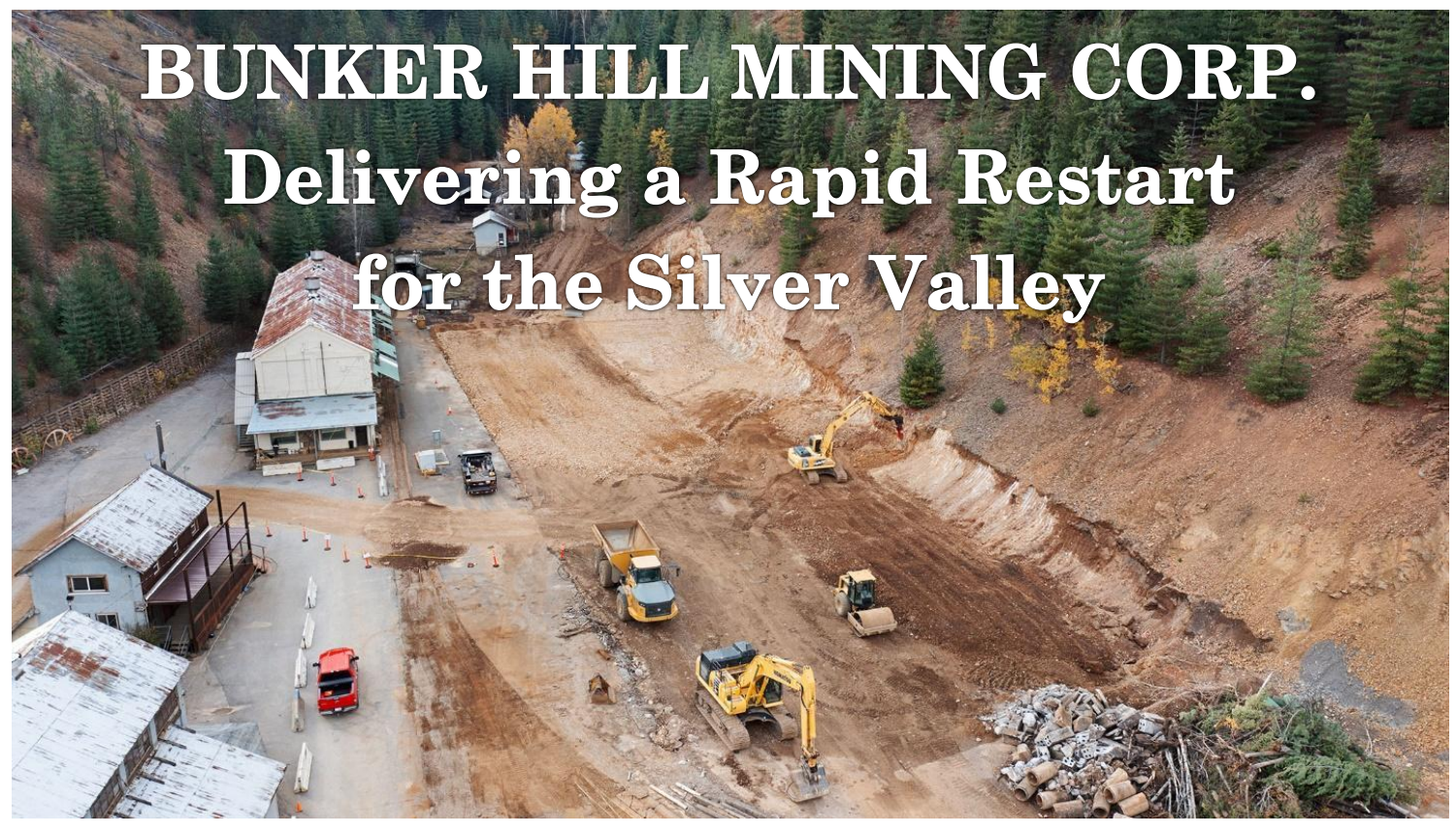
A view of the Kellogg yard after the demolition of the Machine Shop