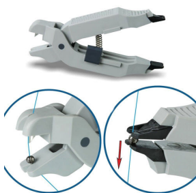
Stonfo Levapiombo Shot Remover

And lastly make sure everything is put away dry & tidy!!