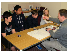
Rig making at one of our indoor sessions