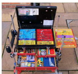
"A place for everything & everything in its place"