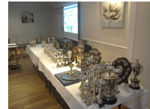
GVAC Junior trophies 2016