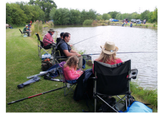
Family fun at one of GVAC's NFM events

Be sure to show this newsletter to your parents so that they know when the Fish Club sessions are taking place... Otherwise you might miss out!!