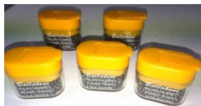
Ballabeni 80gr shot dispensers

"Be brave! don't be afraid to ask a question. Asking questions is a strength... not a weakness"