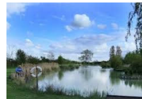
Stonham Barns Match Lake

We will be fishing the match lake which has a very varied species of fish to catch, so it promises to be a great morning's fishing.