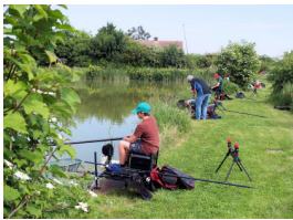
Juniors fishing on Battsiford Top Lake