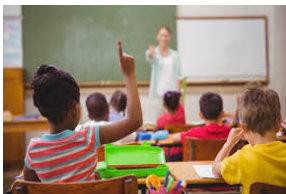
"Can I ask a question please"

Any method and fished to general club match rules.