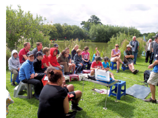
Photography 'breakout' session at Woody's Lake

The coaching team are going to take a bit of a break now, some of us might even do a bit of fishing ourselves.