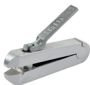
Preston Innovations Stotta

Item: Stotta Pliers Tackle Firm: Preston Innov Price: £7.50 to £8.50