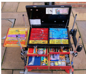
“A place for everything and everything in its place”

Members £5.00 Non-members £6.50 per session.