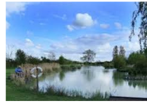
Stonham Barns Match Lake

They will also be promoting our GVAC FishClub events in 2018.