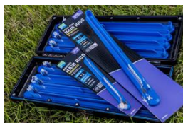
Preston Mag Store Pre-tied hooks

"Every journey starts with a single step!"