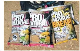
Bait-Tech's Pro Natural range

Check the club diary if you are interested in attending any of these work parties.