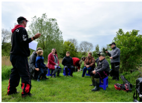
Juniors waiting to start fishing