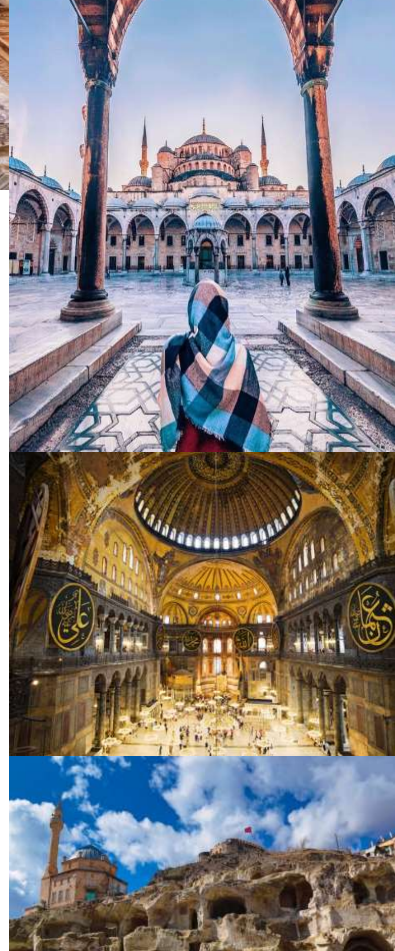
FOR RESERVATION / MORE INFORMATION PLEASE CONTACT YOUR PREFERRED TRAVEL AGENT: