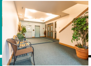
Barrington Professional Center

231 SE. Barrington Drive, Oak Harbor, WA. 98277 ( Highway 20 )