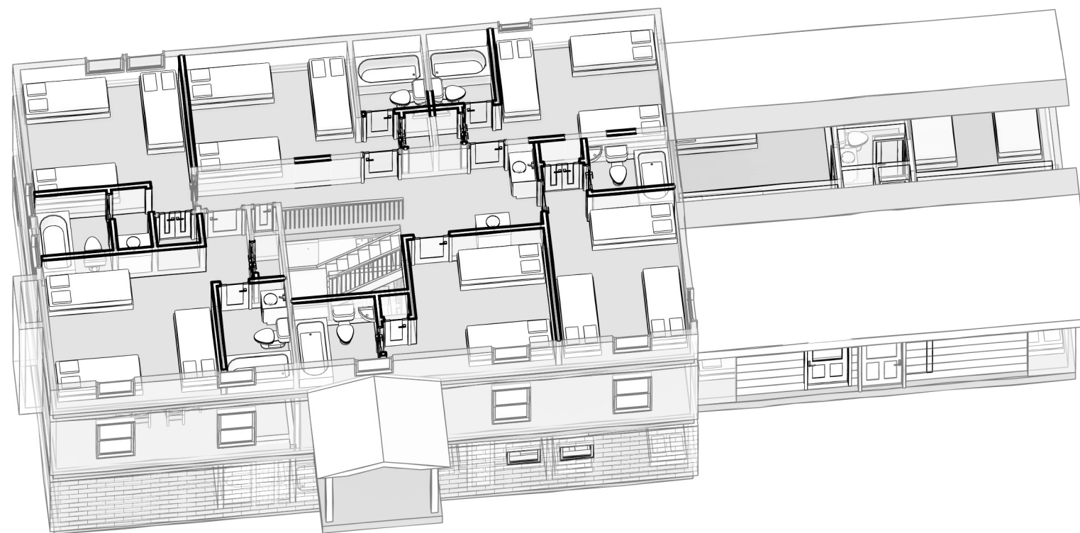
② 3D LEVEL 2 NEW CONSTRUCTION