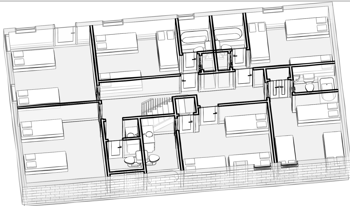
2 3D BASEMENT NEW CONSTRUCTION