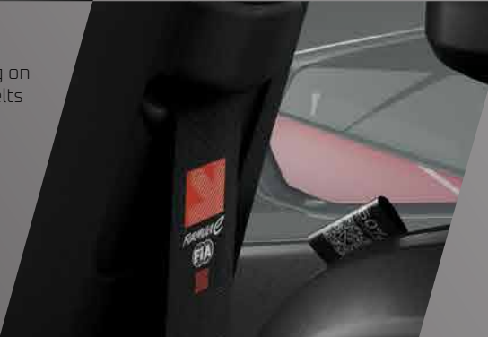
FIA branding on seat belts