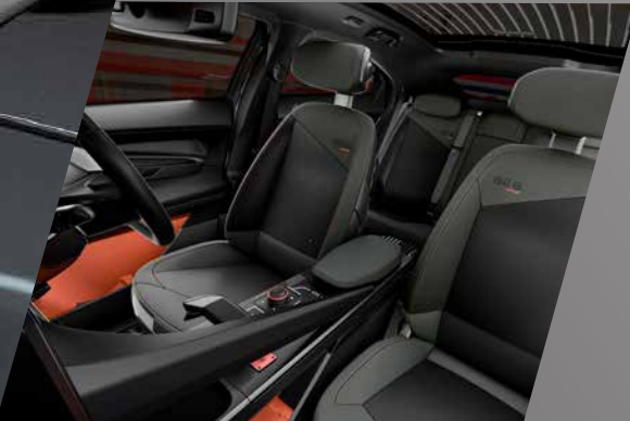
Vibrant Firestorm Orange-themed interiors