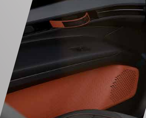
Black and Orange themed dynamic speaker pattern and wireless charging dock