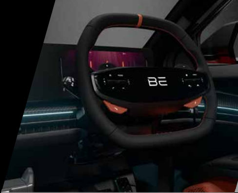
Firestorm Orange-accented steering wheel, in-touch controller, electronic parking brake, start/stop button, and door open straps