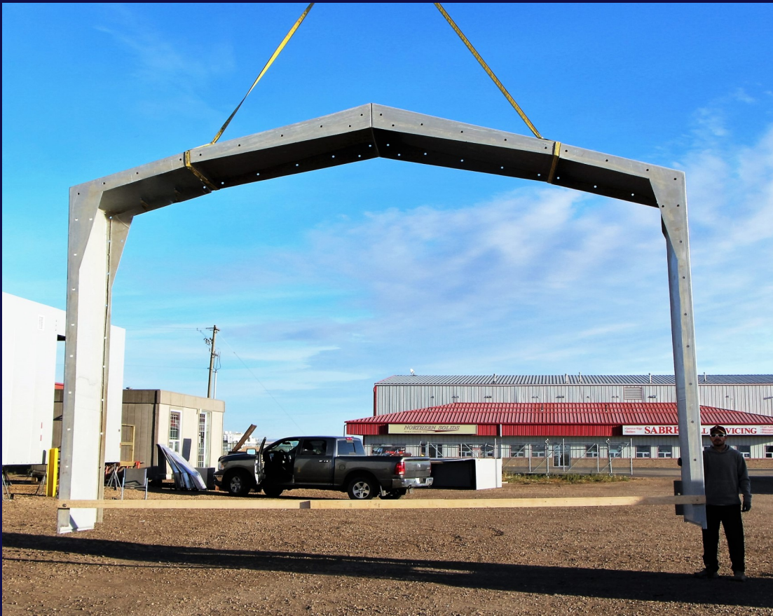
Sections are easily lifted by an extendable forklift or crane.