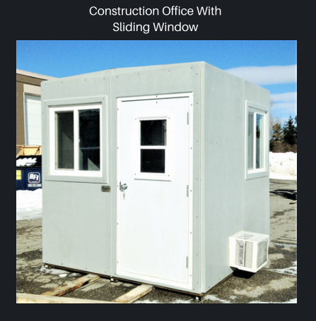
24" x 24" Fixed Window