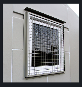
Custom Designed Non-Corrosive Fiberglass Office