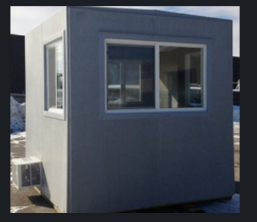
Fiberglass Office Enclosure With Sliding Windows