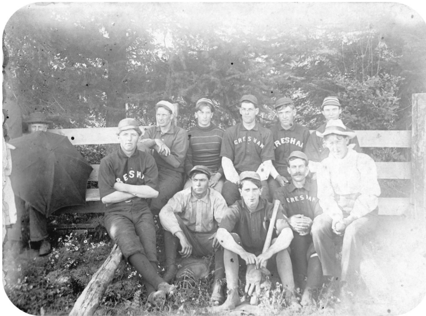
Early Gresham baseball team, circa 1900-1908

Baseball in Gresham has a long history that predates the Gresham Greywolves by a century. As early as 1890, a team known as the Greshams faced other teams from Portland and outlying rural communities in inter-city games that took place on Sunday afternoons. The home field doubled as a cattle pasture during the week. Comprised of locals, the Greshams played more for fun than for competition.