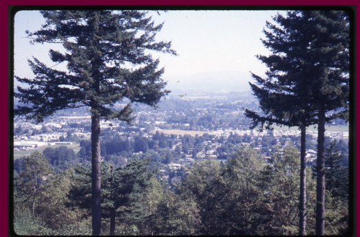
View north from Gresham Butte/ Walters Hill