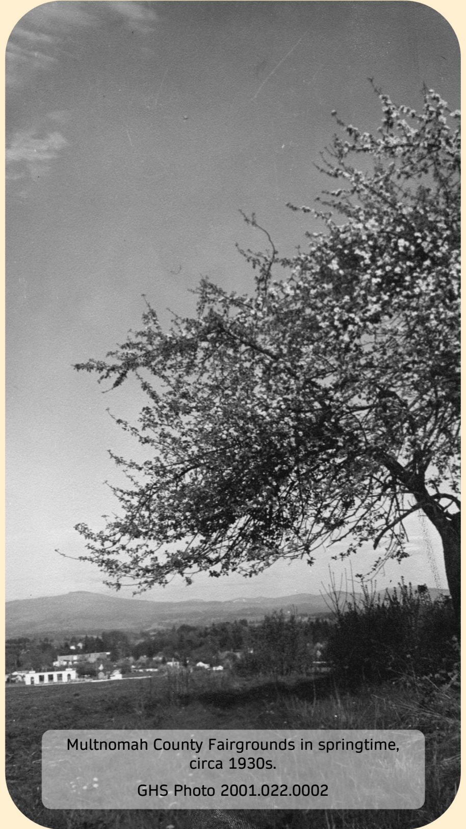
Multnomah County Fairgrounds in springtime, circa 1930s.