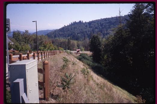
Persimmon neighborhood in early development