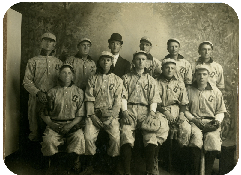
Gresham Giants, circa 1911