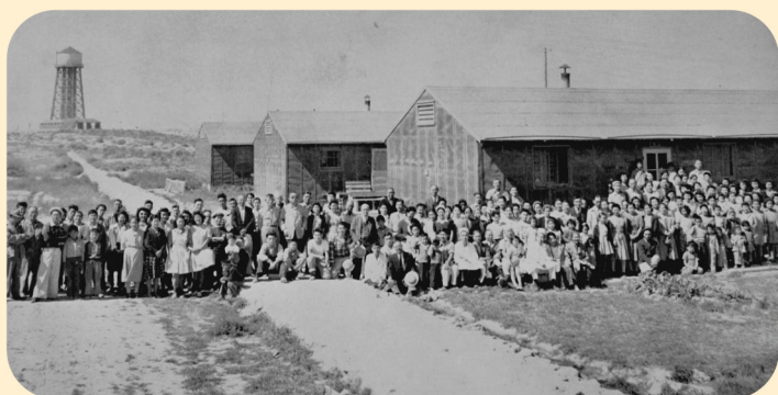
Residents of Block 21 at Minidoka Internment Camp, from the Minidoka Interlude