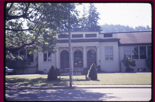
West Gresham Grade School