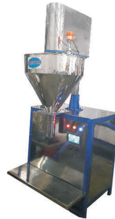
SEMI AUTOMATIC AUGER FILLER