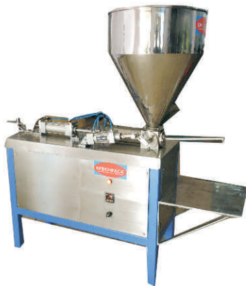
SEMI AUTOMATIC PISTON FILLER