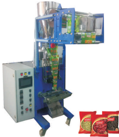
PNEUMATIC CHUTE TYPE CUP FILLING MACHINE