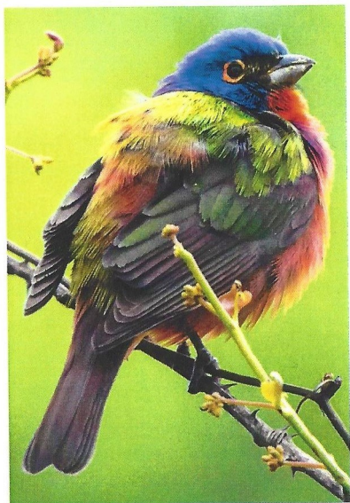
The Male Painted Bunting

As winter thaws into spring... Just this fellow foreshadows his message with tip to tail neon lights... He is only seen in TX, AR, OK, LA & a narrow slice of GA, SC & upper northern Mexico.