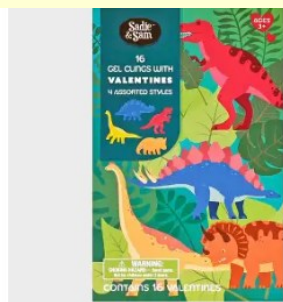
16ct Sadie & Sam Valentine's Exchange Cards Dinosaur Gel...

This month's theme is all about love: loving our family, loving those around us, and loving our pets. If you would like to bring your pet for Show and Tell, please email us to sign up. A parent must be present during Show and Tell to handle the pet. Infant class will not participate. A picture/poster of your pet is also welcome.