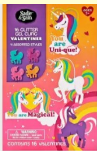
16ct Sadie & Sam Valentine's Exchange Cards Unicorn Gel...