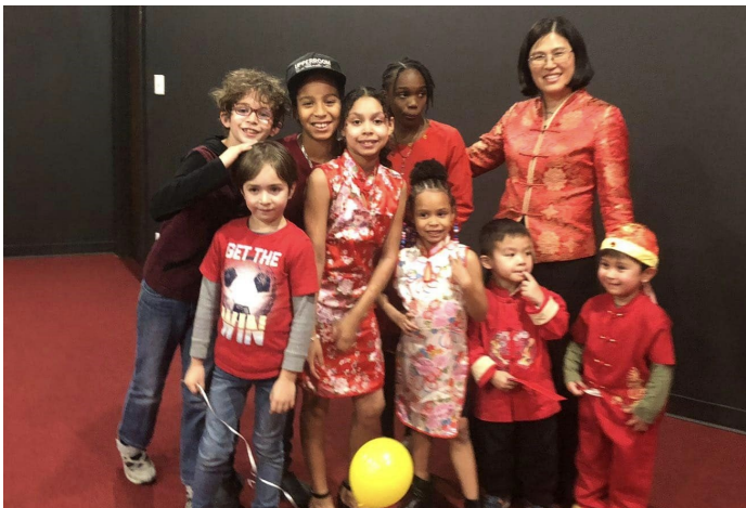
Some of our students performed at the North Texas Hubei Association Chinese New Year celebration.