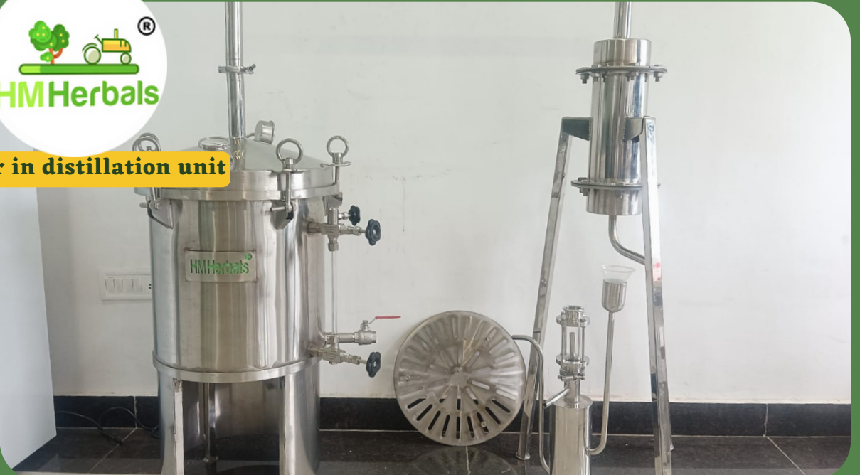
Container, Jaali, Condenser with full Accessories