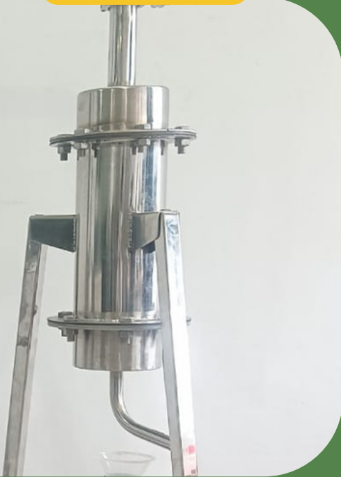
Shell Tube Condenser