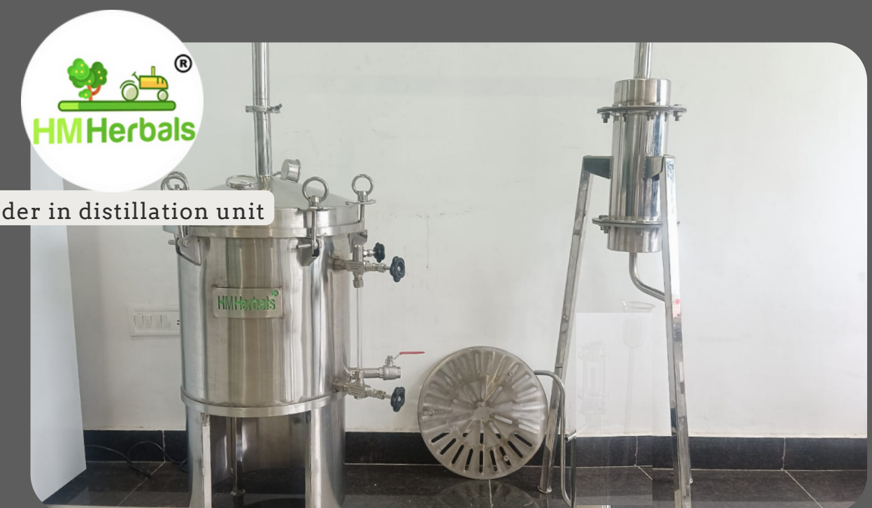
Container, Jaali, Condenser with full Accessories