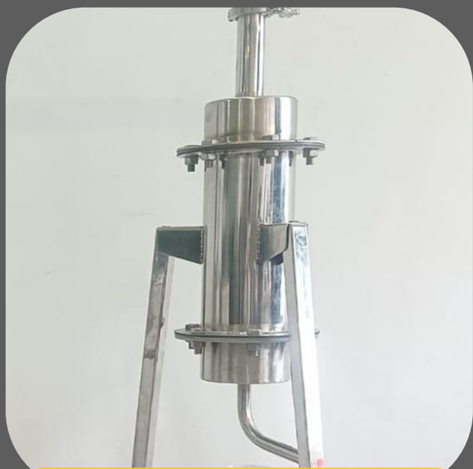
Shell Tube Condenser