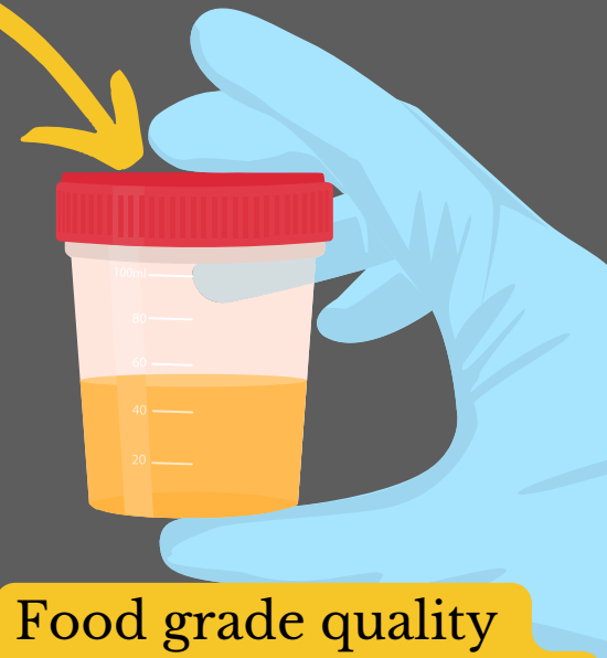
Food grade quality gau mutra extract output