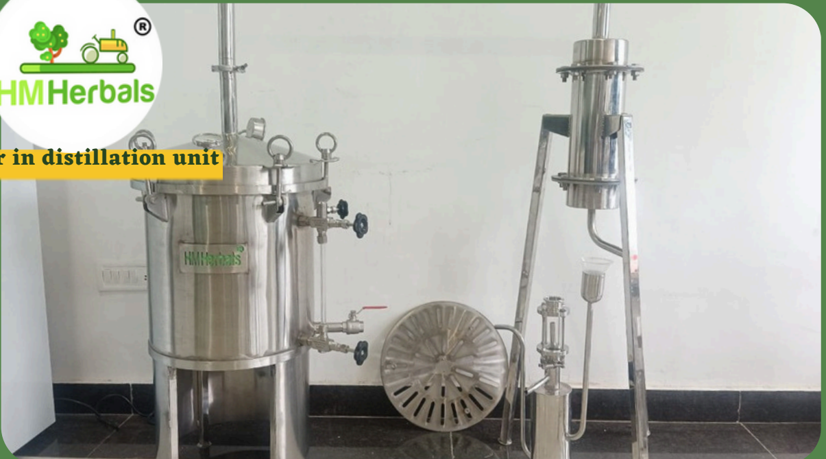
Container, Jaali, Condenser with full Accessories