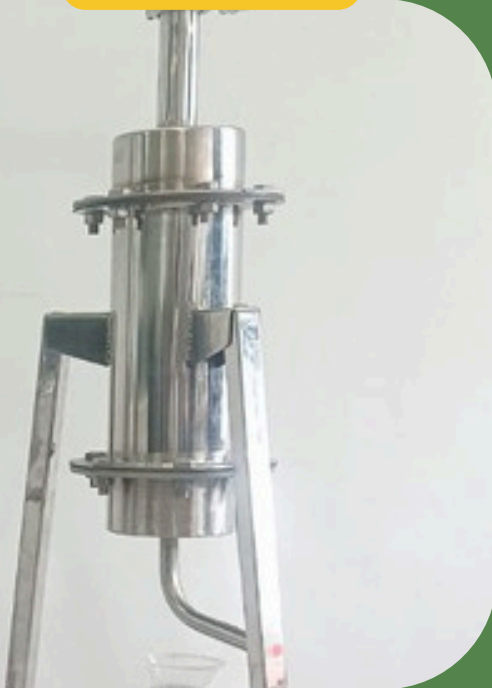
Shell Tube Condenser