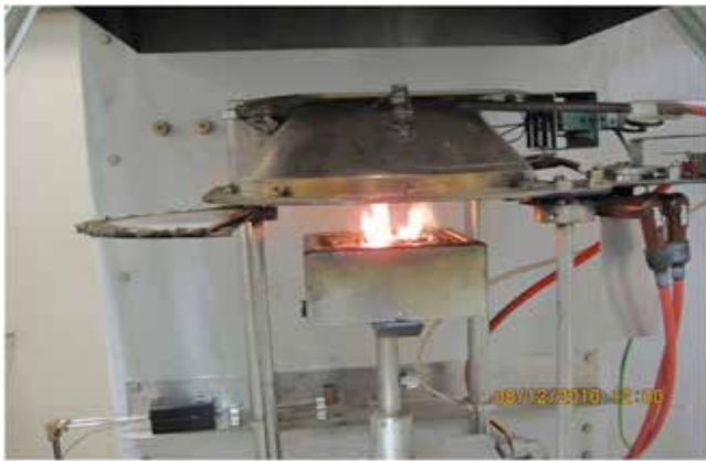
Figure 1—Cone calorimeter.

This test was designed to determine the viability of each material that would be used in the ICAL test. The Cone Calorimeter (figure 1) provides results for each material's ignitability, heat release rate, mass loss rate, and ability to maintain structural integrity when exposed to radiant heat flux. Materials were initially tested at 25 kilowatts per square meter ( \text{kW}/\text{m}^2 ) and 65 \text{ kW}/\text{m}^2 because these values are representative of the heat associated with wildland fire situations. Since none of the wraps ignited at 65 \text{ kW}/\text{m}^2 additional tests were conducted at 85 \text{ kW}/\text{m}^2 . Each material was tested several times at each heat flux level to assure the results were valid. A total of 129 tests were performed on the Cone Calorimeter (Zhou 2010).