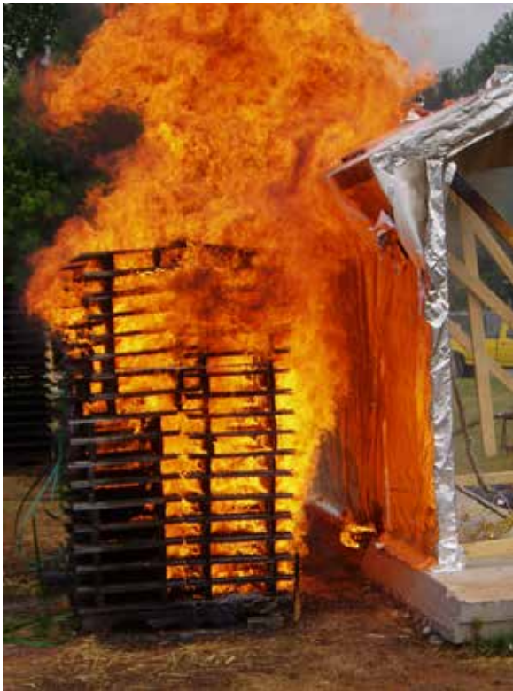
Figure 11—Delamination of wrap.