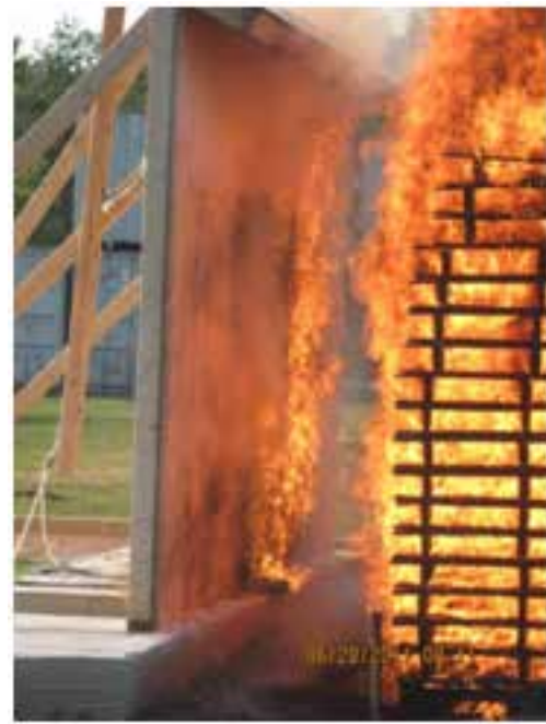
Figure 8—Gel test burn.