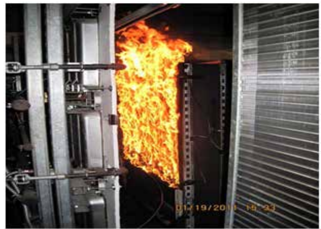
Figure 4—FX-WF in ICAL.

During the ICAL tests (figure 3), Textile 2025 was the only wrap that ignited. Time-to-reach values were greatest for Firezat HD, Firezat LD, and S-Barrier respectively. Thermal resistance for these three wraps was identical to the time-to-reach rankings. Results from the ICAL measurements for coatings indicated that TTIs were longest for FX-WF, A-18, and FX-100 respectively (figure 4).