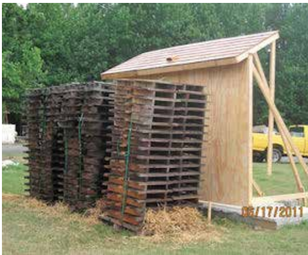
Figure 10—Outdoor test setup prior to ignition.