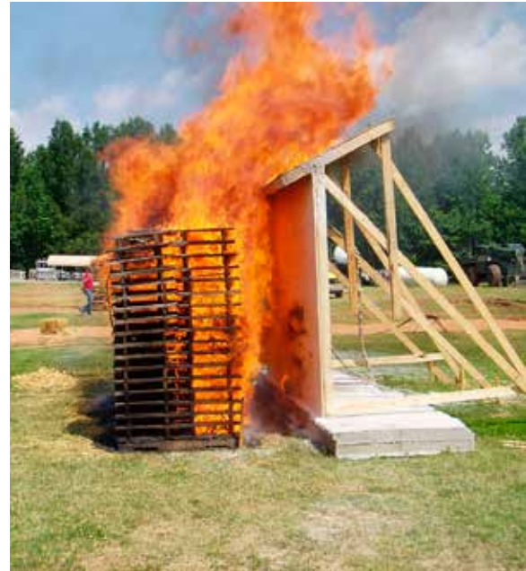
Figure 12—Thermo Gel 200L.