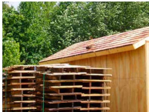
Figure 6—Firebrand on roof of outdoor test assembly.

Results from the outdoor test differed from the results of the Cone and ICAL tests. These differences are attributed to the effects of wind, strong direct-flame impingement, and the resulting thermal impact on the materials' surfaces. The Cone and ICAL tests also did not have a convective heat component.