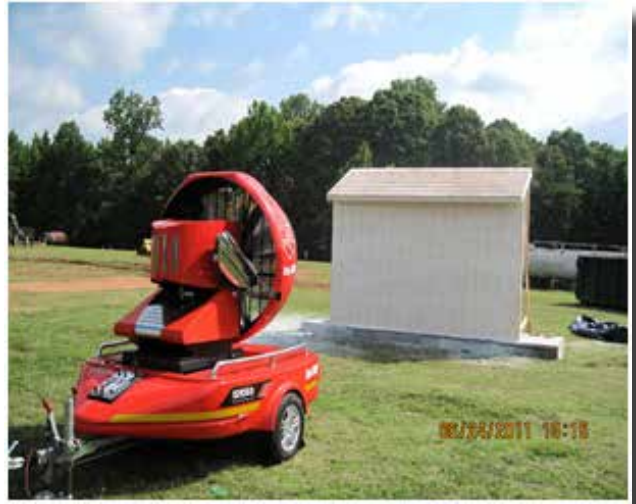
Figure 7—Gel drying.

Results from the gel tests revealed that Thermo Gel 200L provided a similar level of protection to the wraps and coatings in its ability to delay ignition. Test ignition first occurred on the roof at 2:31 (minutes:seconds) for the 10-minute drying time; roof ignition occurred at 1:58 for the 60-minute drying time test in the area where the firebrand was located (figure 7). Wall ignition occurred at 3:06 for the 10-minute drying time test and at 3:00 for the 60-minute drying time test. Temperature and heat-flux differences between these two tests may have contributed to the different ignition times. The heat flux on the wall during the 10-minute drying test was in the range of 30–40 kW/m 2 while the heat flux approached 60 kW/m 2 prior to ignition during the 60-minute test (figure 8).