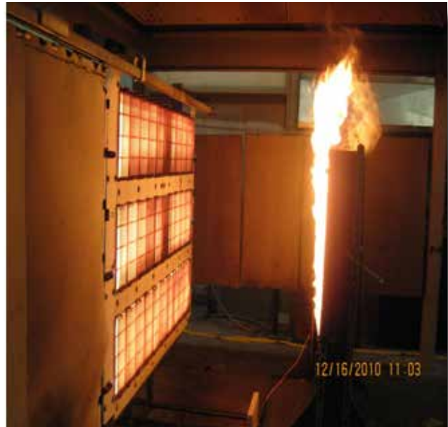
Figure 3—ICAL test.

During the ICAL tests (figure 3), Textile 2025 was the only wrap that ignited. Time-to-reach values were greatest for Firezat HD, Firezat LD, and S-Barrier respectively. Thermal resistance for these three wraps was identical to the time-to-reach rankings. Results from the ICAL measurements for coatings indicated that TTIs were longest for FX-WF, A-18, and FX-100 respectively (figure 4).