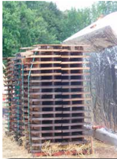
Figure 5—Firebrand on wall of outdoor test assembly.

Wooden assemblies were constructed for the outdoor test. The structure walls consisted of 12-foot by 8-foot plywood and the roofs were 12-foot by 4-foot Western cedar (figures 9 and 10). Materials were attached or applied to the entire structure according to the manufacturers' recommendations. Each coating was tested at two heat flux levels: 35 kW/m 2 and 50 kW/m 2 . The wraps were tested at 50 kW/m 2 and the gel was tested at 50 kW/m 2 with drying times of 10 and 60 minutes. Heat was supplied by burning stacks of dried pallets and a piloted-ignition source was supplied by two ASTM E108 Type B firebrands, one placed on the wall and one attached to the roof assembly (figure 5 and figure 6). Heat-flux levels for the outdoor tests are not stable; ambient temperature, wind, pallet ignition, and fire growth all affect the amount of heat received by the test structures. However, in most cases the heat flux was at or near the designed level prior to ignition of the structures.