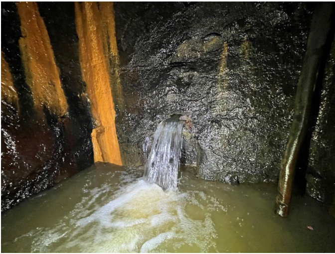
Riser showing "capped" flow around stuck (closed) gate.