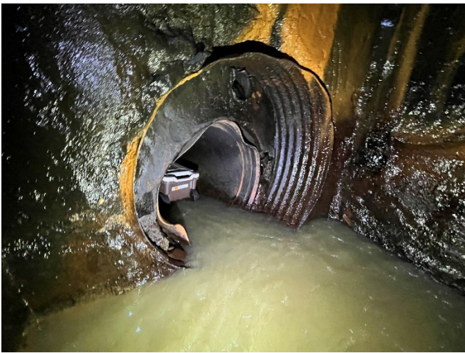
Outflow pipe at bottom of riser, note previous repairs to outflow pipe that resulted in reduced diameter.