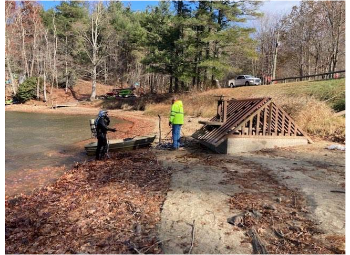
Bander Smith personnel suited up for intake pipe inspection / temporary repairs.

obtaining funding for this much needed project, please reach out to us.