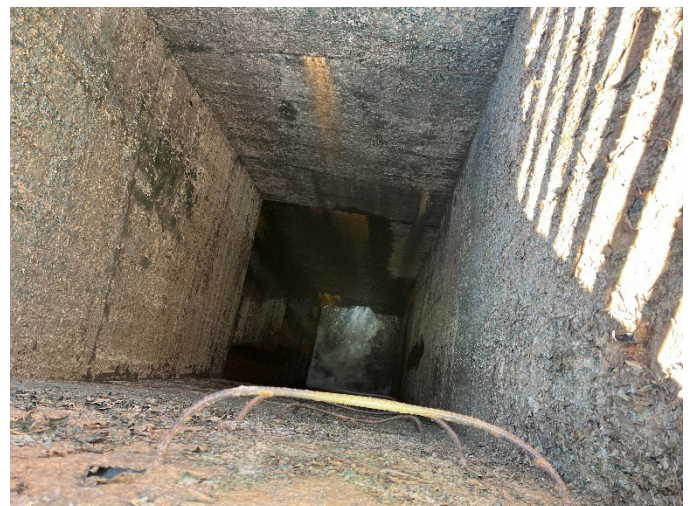
Dam riser as viewed from uplands.