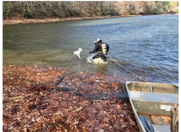
Bander Smith personnel suited up for intake pipe inspection / temporary repairs.