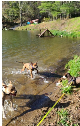
Four-footed residents of Ashe Lake enjoying the warming waters! (Pictured: Tora, Thor and Bandit).

Our kayak racks located next to the Lake access are there for all Ashe Lake property owners to use. We do recommend securing your kayak to the rack as a means of prevention.