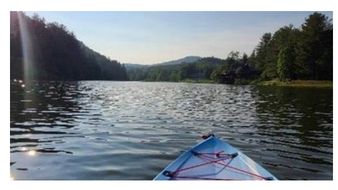
ASHE LAKE PADDLE CLUB - Meeting Sunday evenings (weather permitting) at 6:00 pm at Association Dock .