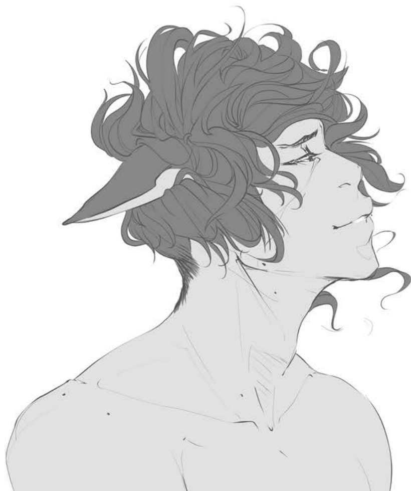
Vahn'a Minerva ▶