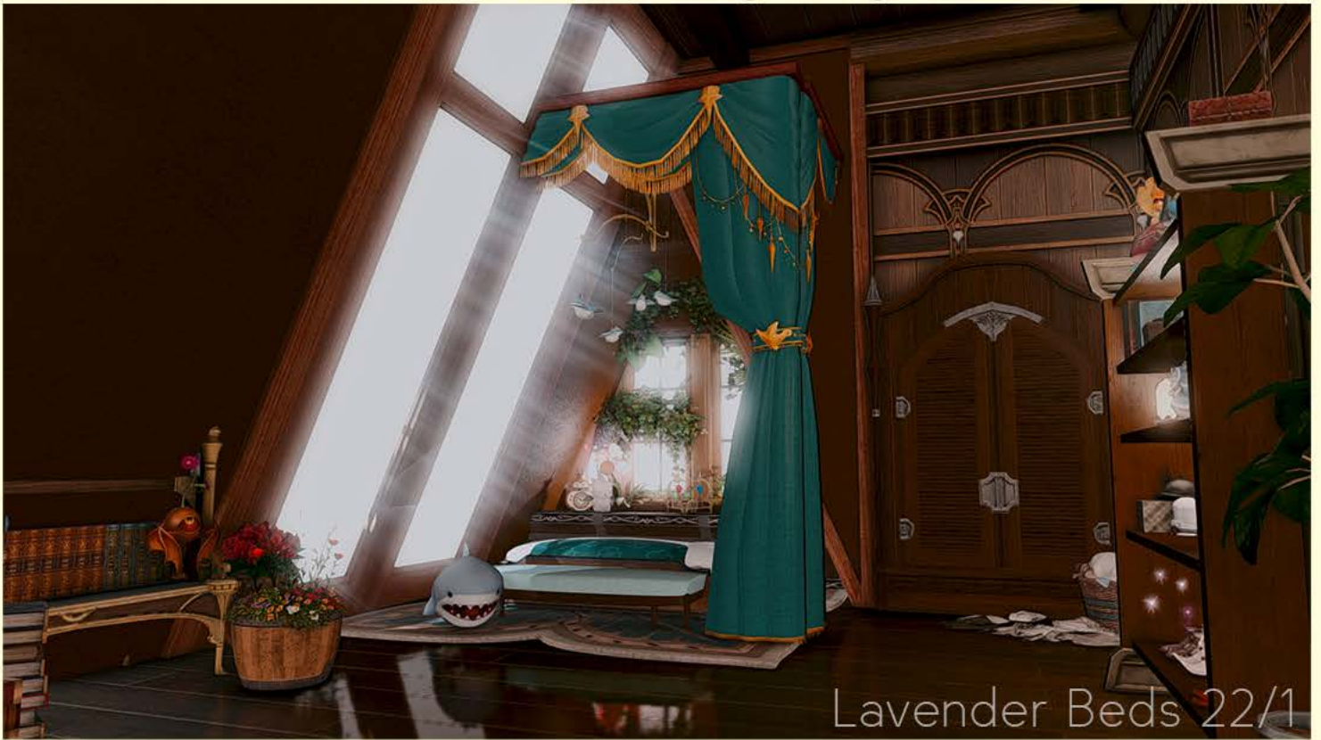
Lavender Beds 22/1

Tour around in these fabulous housing designs!