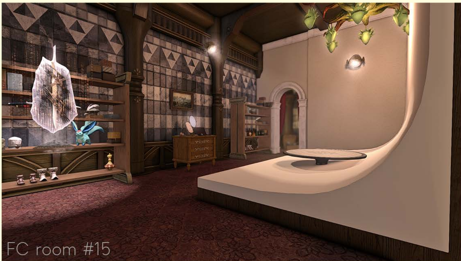
FC room #15