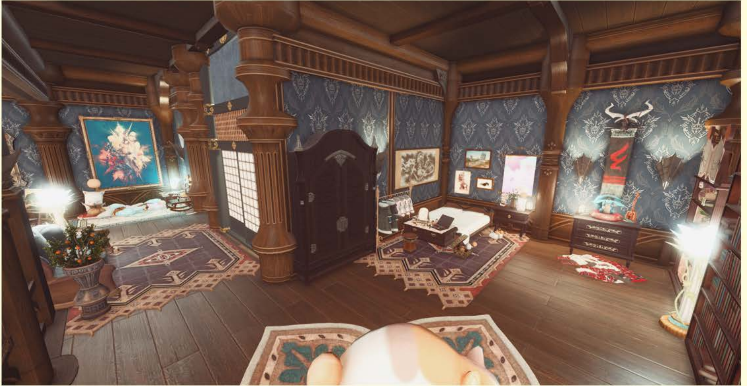
Kitika (Designed by Yuzuyu)

Tour around in these fabulous housing designs!