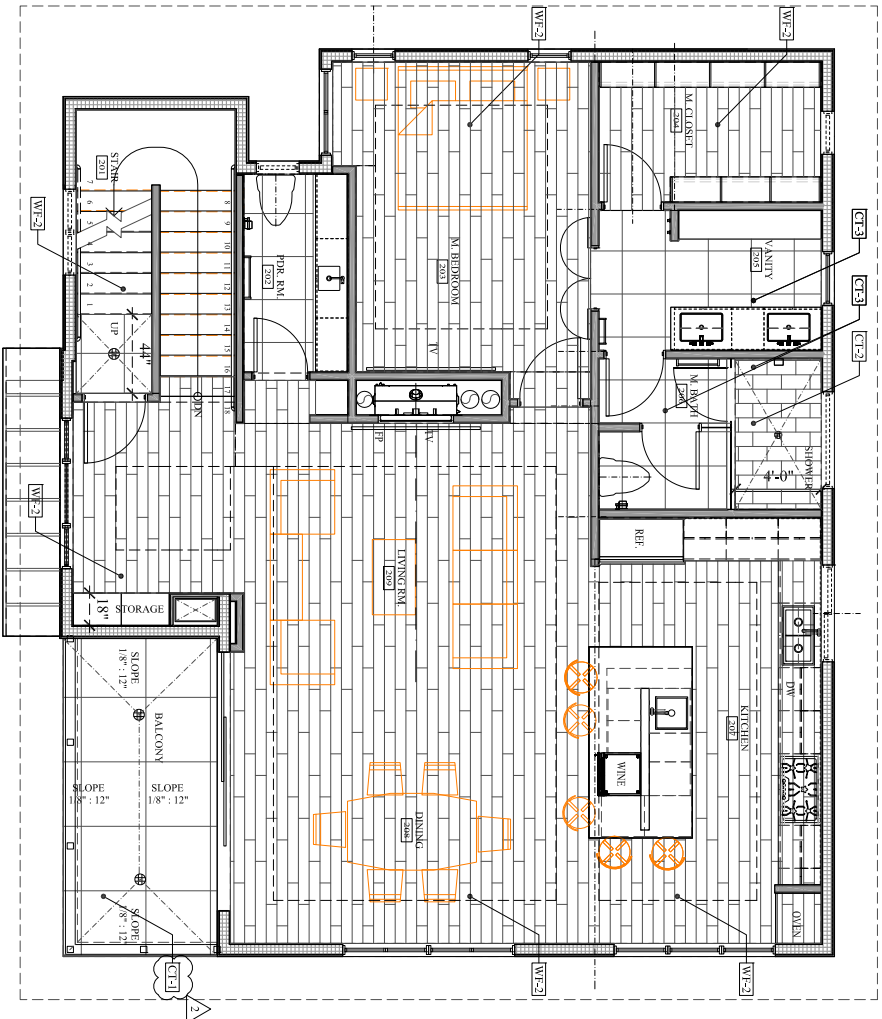
2P SECOND FLOOR FLOORING PLAN - UNIT 2