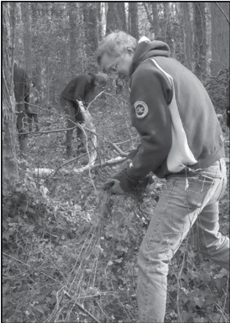
Facebook picture of Homestead clean-up.

Thanks so much to the 127 dedicated volunteers who came out on this Day of Service to help pull ivy at John’s Homestead. We OBLITERATED the ivy in a huge area along the trail and had a lot of fun doing it! Thanks also to our wonderful sponsors, The Corner cup Coffee and Rehoboth Baptist Church as well as our new partners PEPSI and Tucker Brewing Company whose employees came out to volunteer with us today. We are so thankful for this wonderful support from the community!