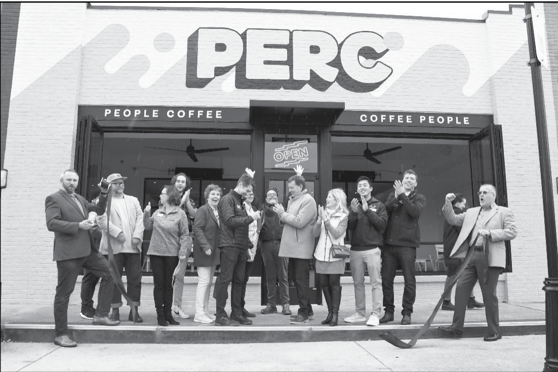
PERC Coffee is now open on Main Street