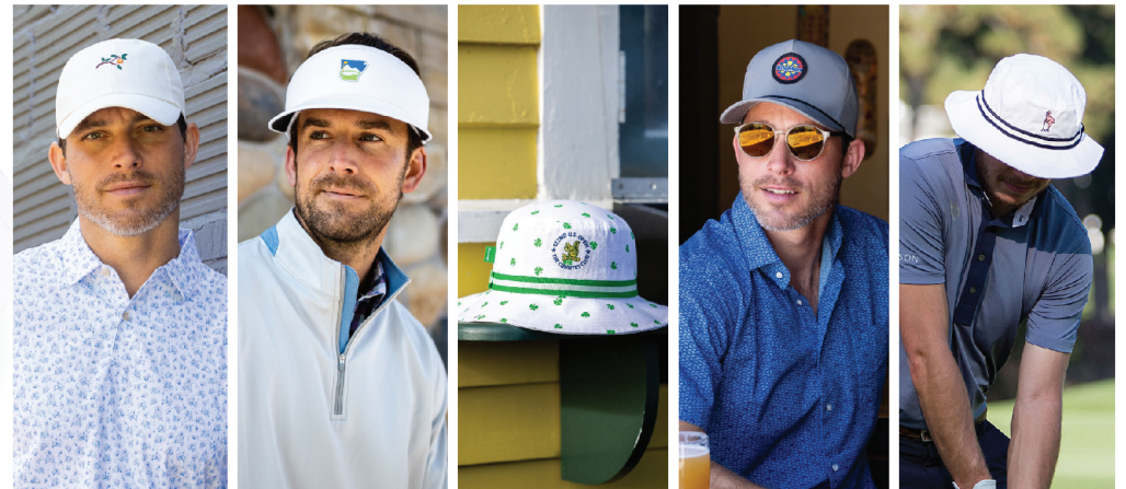
X210P The Original Performance