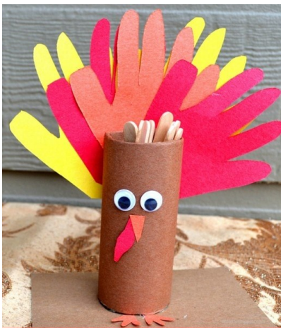
THANKFUL TURKEY TOILET PAPER ROLL CRAFT