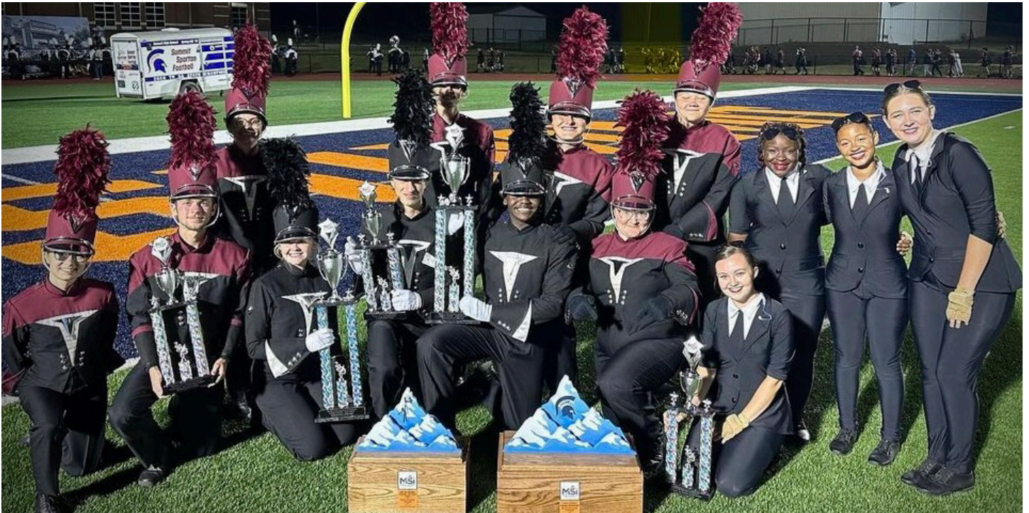
2023 Large Division Grand Champion: Tullahoma High School