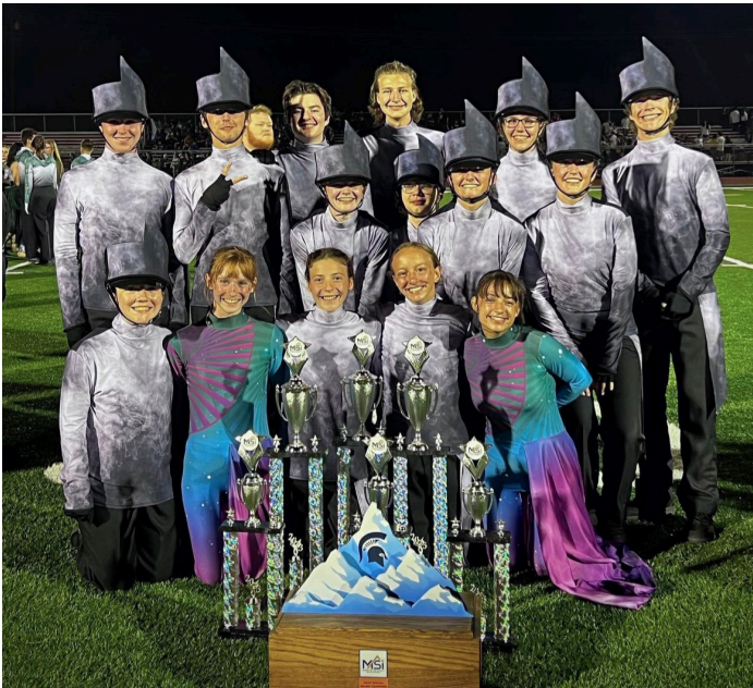
2023 Small Division Grand Champion: Green Hill High School