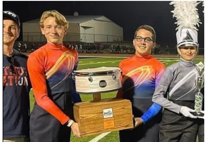
2023 Rowland "Gabe" Fry Memorial Percussion Award: Oakland High School