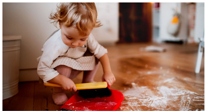
Healthy at Home: Family Routines that Work

Our family relationships are different because our personalities and temperaments are different. Without family routines, everyone's expectations