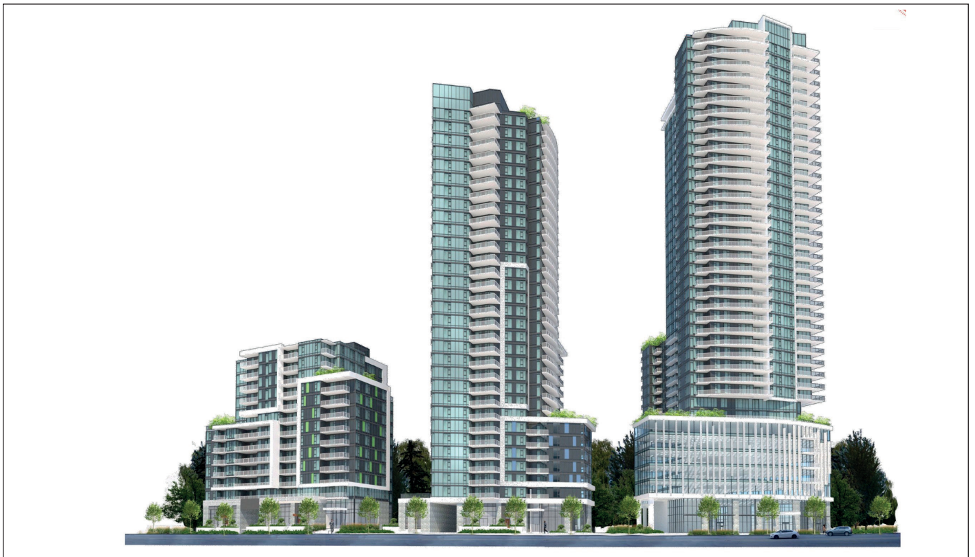
View looking north-west from the corner of 108 Ave & 140 St