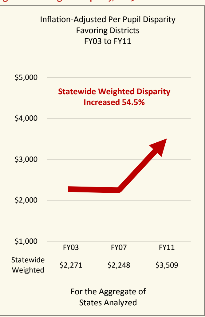
Figure M1: Change in Disparity, FY03 to FY11