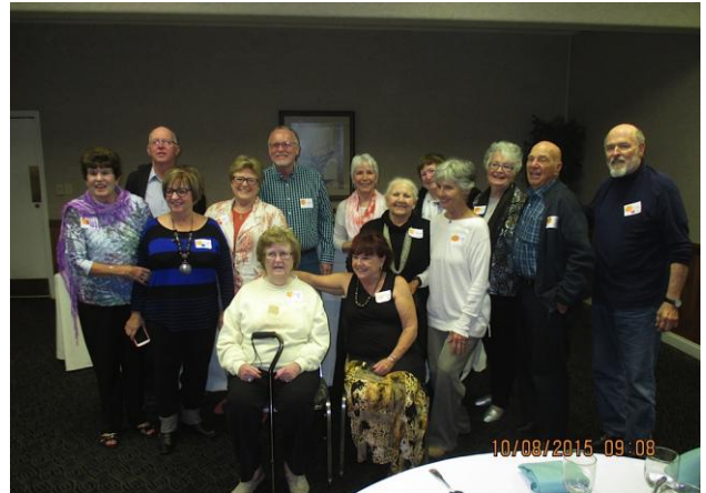
Attendees from Region 3