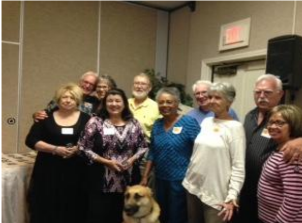
Attendees from Region 2