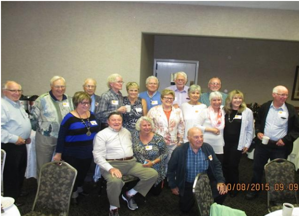
Attendees from Region 4