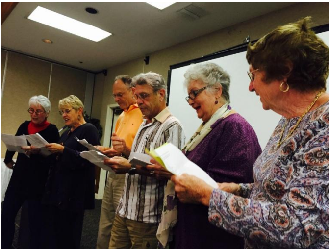
Our own REACTA Singers Visit REACTA.org to hear them sing.