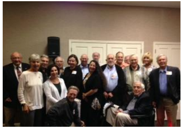
Attendees from Region 1