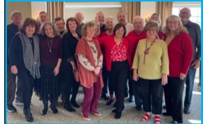
Region 4 retirees attend holiday party at Ponte Winery in Temecula.