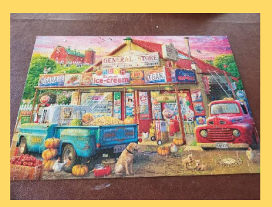
REACTA members joined in the pandemic jigsaw fad. Dom and Joann Summa circled around their dining room tables with one goal – find the edges first.