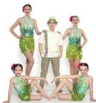
5 Students Sample—$110