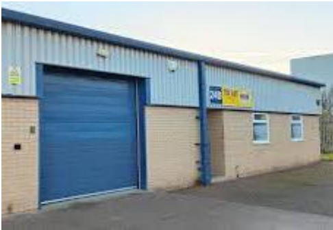
Building Type Small Commercial Unit