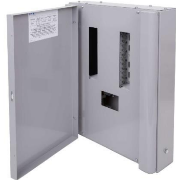
EATON EBM81 8 Way TP-N Consumer Unit 125 Amp Main Switch