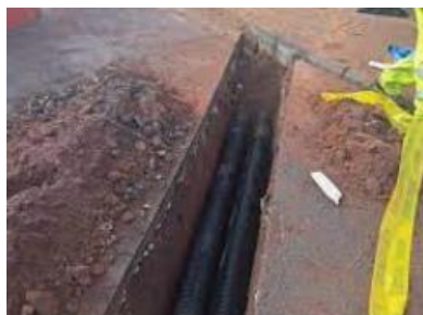
Cable Installation Installed in a duct buried in the ground.