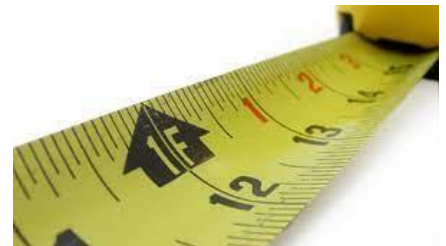
Circuit Length 43 metres