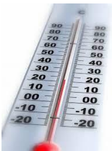
Highest Ground Temperature 35°C