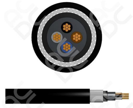
Cable Type 4c multicore armoured 70°C thermoplastic insulated cables.