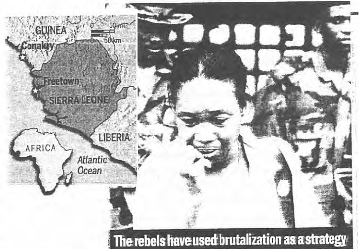
The rebels have used brutalization as a strategy

PEACE IN SIERRA LEONE THROUGH NEGOTIATIONS AND RATIFICATION OF THE CONSTITUTION FOR THE FEDERATION OF EARTH