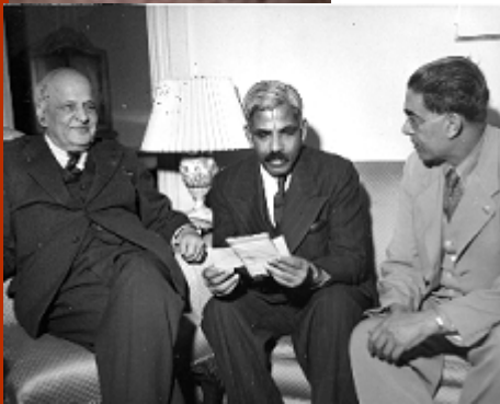
The formidable Trio who made it happen..

Indian Delegation to UN conference at San Francisco in 1945 had 3 eminent personalities: Sir A r c o t Ramaswamy M u d a l i a r (middle), Sri V T Krishnamachari (left) and Sir. Firoz Khan Noon. India was not in favor of a system backed by veto power. After much persuasion relented only when