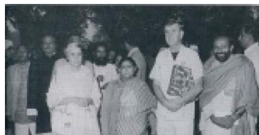
WCPA Officials with Indian PM Mrs.Gandhi In 1981

spect for all nations as well as equal opportunity for each people to develop to its fullest potential. Enlightened representative's of nations must develop international convention's which will make it possible for all Sovereign Nations to cede some of their powers out of their free will to international institutions in the confidence that their dignity and just interests will never be compromised.”