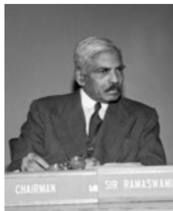
Sir.Arcot Ramaswamy Mudaliar Leader of Indian delegation

right. They even need not if they really understand the meaning of sovereignty as put forth by Sir Arcot Ramaswamy Mudaliar: “We talk of independence. We talk of sovereign rights -- I am one of those that believe in sovereign rights--but I believe the world has come to a stage when the emphasis is not to be so much on independence as on interdependence.