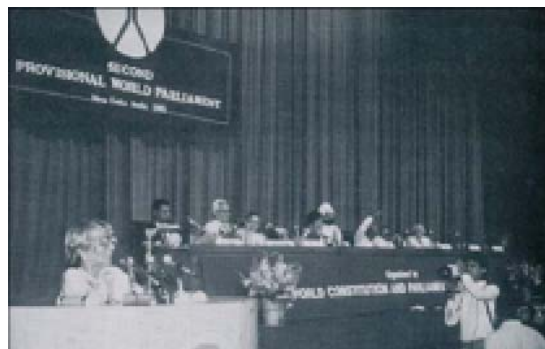
2nd PWP session in 1985 at New Delhi presided by Sri Giani Zail Singh, President of India

To register: 15th PWP Session Registration (wcpaindia.org)