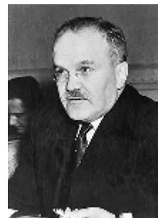
India will be heard, too.

This part of history has missed the attention of the world. Mr.V Molotov, the head of Russian delegation to UN conference in 1945, made an interesting observation : “We have at this Conference an Indian Delegation. But India is not an independent state. We all know that the time will come when the voice of an independent