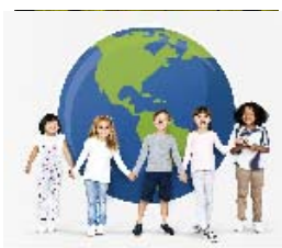
Basic Global Education Programs from WCPA