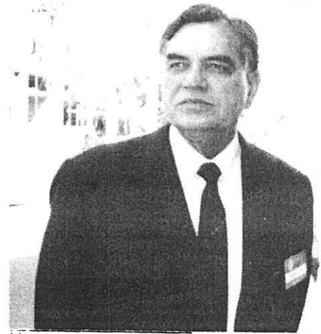
Hon. Bal Ram Jakhar

Friends, the advancements in science and technology have made the world a very small place. The nation state became a stable form of human organisation at a time when the binding forces on the lives and affairs of men were religion, language or culture, limited to a particular geographical area. Things have changed radically in the recent past. From the moral, scientific, economic, technological and even social points of view, the nation state is becoming an inadequate form of organisation to guide and control the lives of people. In fact in many cases the nation states, as they exist today, are often leading to international tension and wars. Hence the need for thinking in terms of the human race as a single unit of organisation. Therefore as citizens of the world, we must think and work for the welfare of the human race. The world government will have no equals and no rivals. It will have no foreign affairs and there will be no frontiers to be guarded. It will work only for the good of all. What a wonderful arrangement! The various agencies at the international level are, no doubt, useful but the question is whether they are adequate for the needs of the present and future generations. A world government and world parliament, as envisaged now, can solve many of the problems confronting humankind. The exploitation of