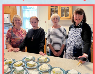
January UFA Fun Day!