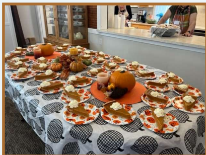
October 2022 Member Meeting