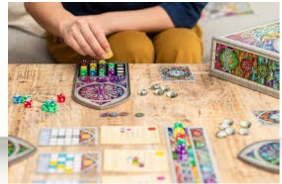
Table Top Games / Roll, Move, Win- A Board Game Adventure