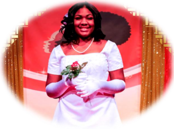
La. Faith Harbor