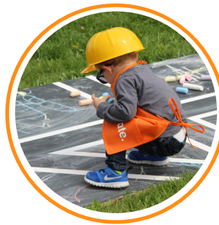
Sidewalk Chalk City presented by Tri-North