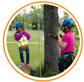
Tree Hoist presented by Conney Safety & Dane County Arborists

In our efforts to produce a bigger and better event we're organizing our exhibits into two sections.