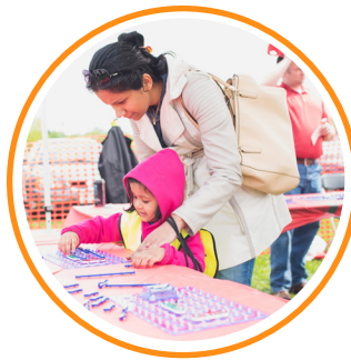
Connect the Circuit Presented by Pieper Power