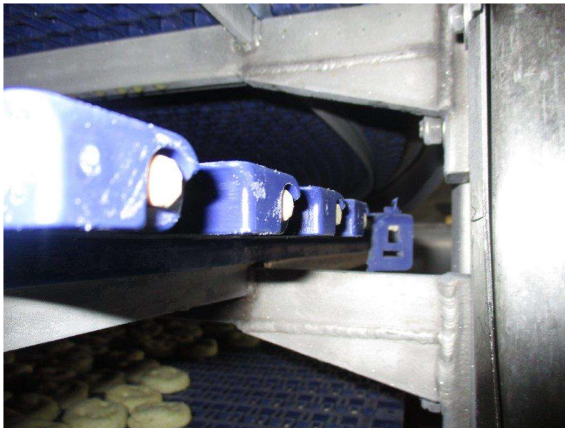
Figure 3: Belt breakage near cross-supports