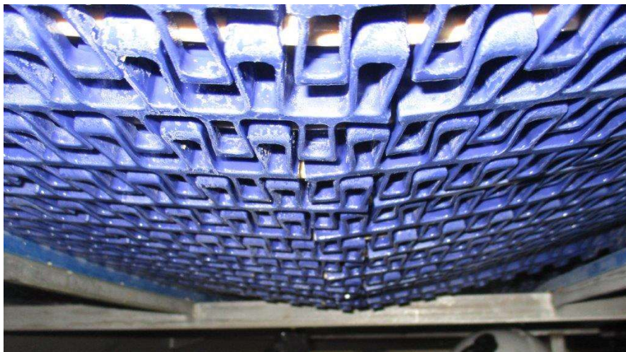
Figure 4: Belt split