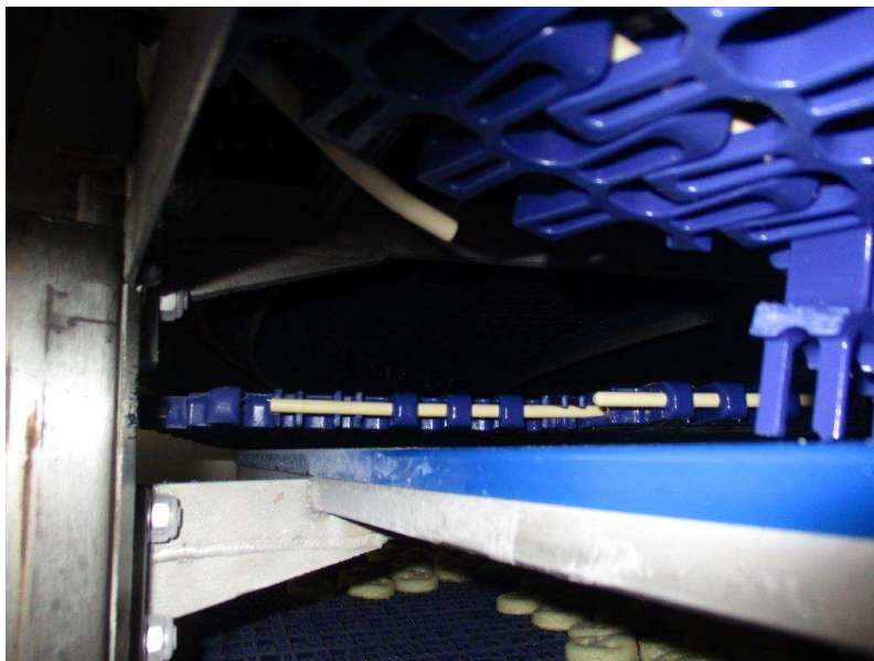
Figure 2: Belt breakage at upper section of cage near cross-supports