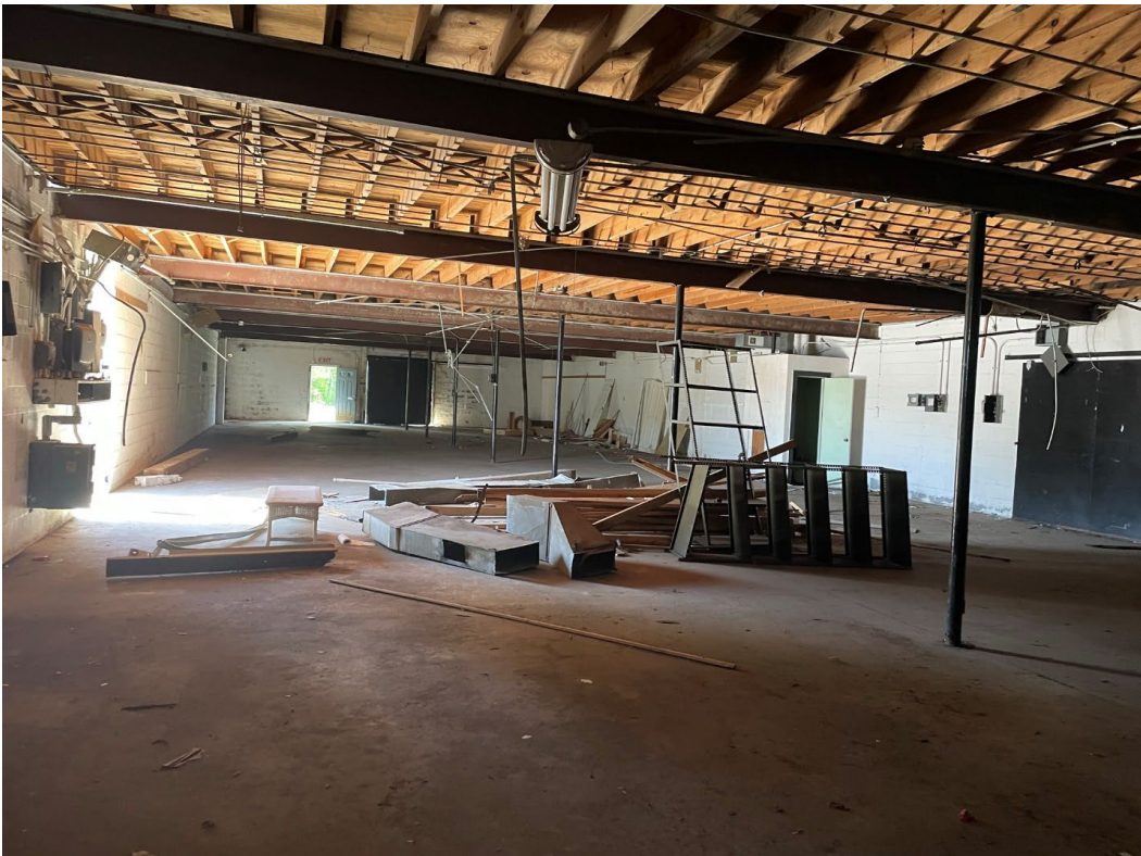
5,000 +/- SF Section – Center Bldg – Repaired Roof – Formerly Two Restrooms