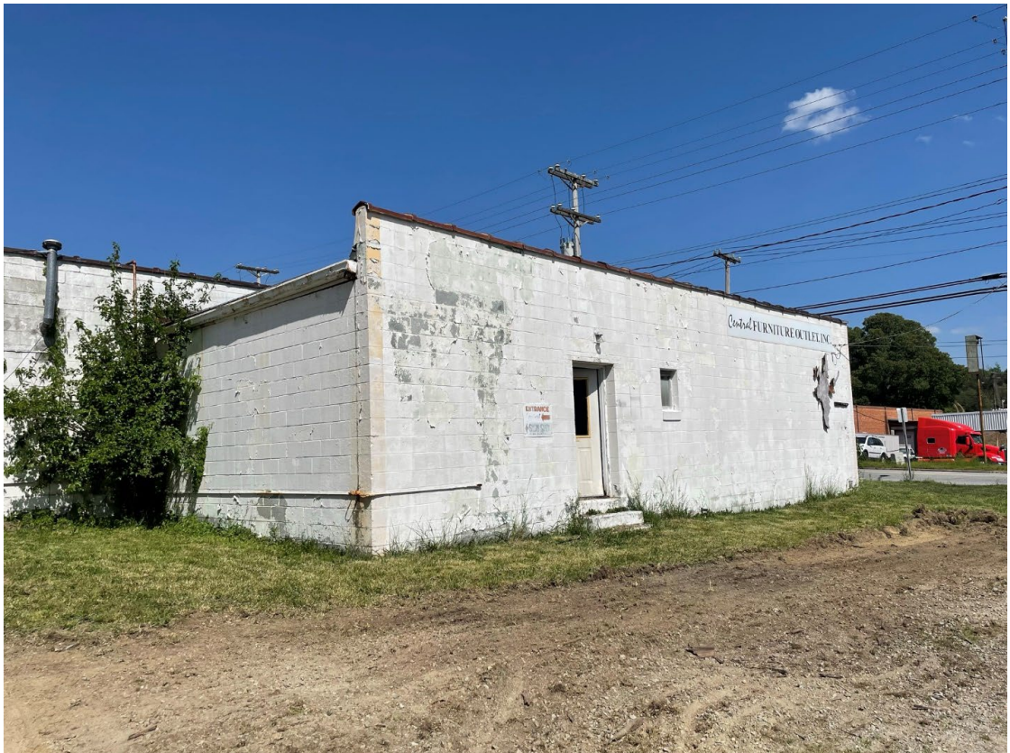
Apx. 900 SF Section – Roof Collapsed Not Demolished