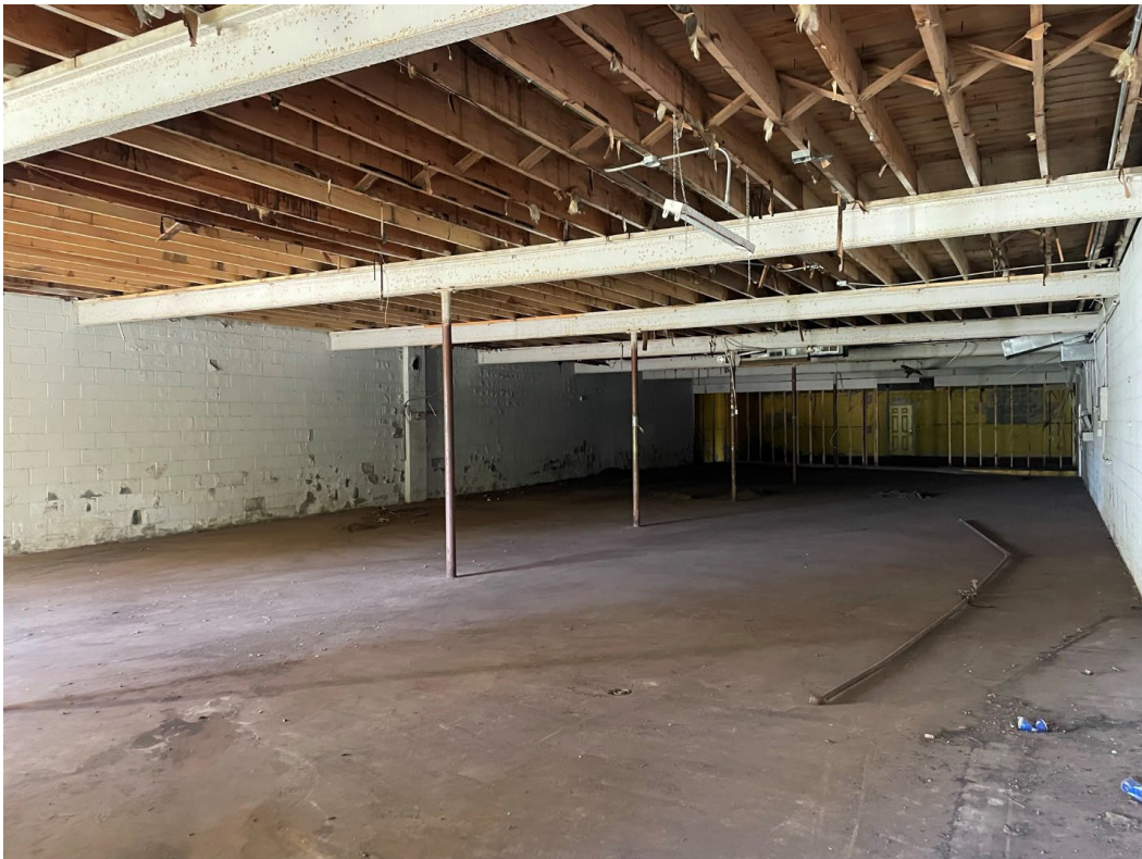
4,750 SF +/- Section – New Roof – No Plumbing