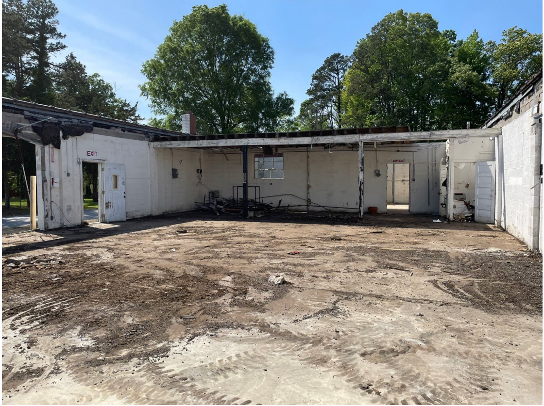
5,082 SF +/- Section – No Roof – Formerly Two Restrooms